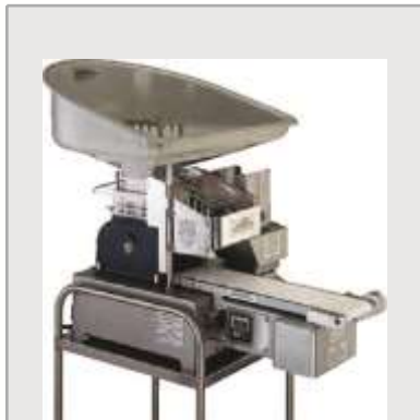
Super Portioning Machine with Programmable Counter and Conveyor